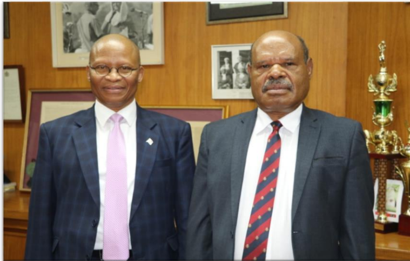
South African Chief Justice Mogoeng Mogoeng and Former Chief Justice of PNG, Sir Salamo Injia, Kt, GCL

One of the highlights of the year was the lecture presentation by the Chief Justice of South Africa, Mogoeng Mogoeng.