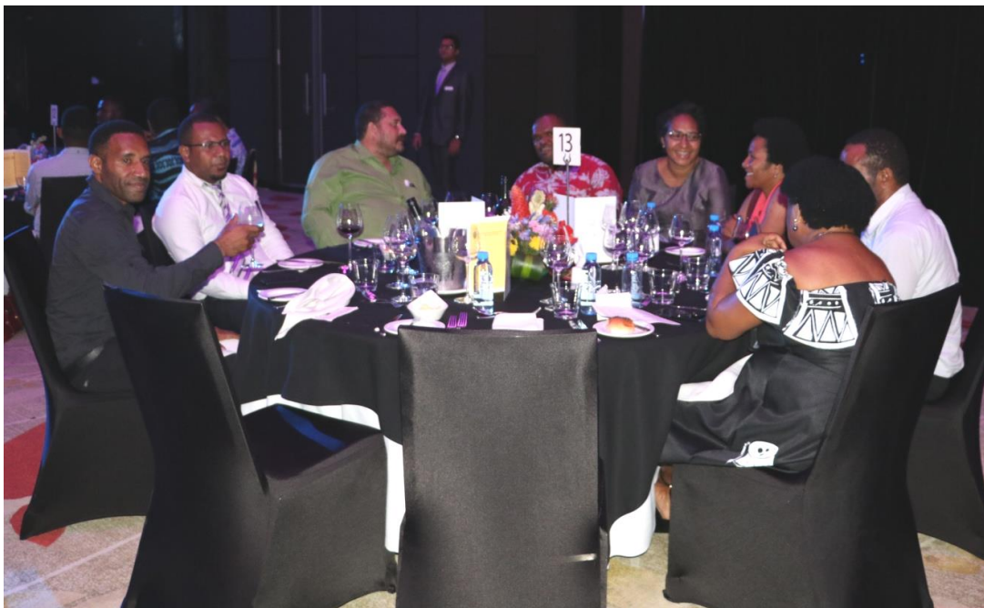
Lawyers attending the 2018 Bench Bar Dinner at the Stanley Hotel.