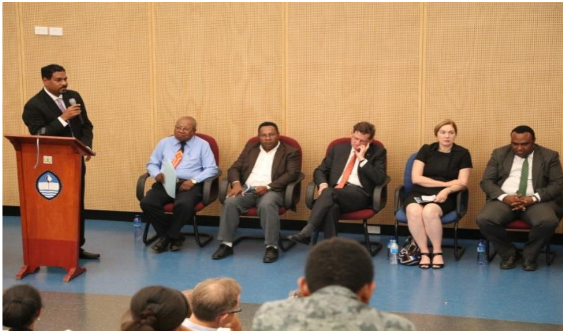
PngCJE Executive Director speaking to the audience at the first Sir Salamo Injia Lecture at UPNG.