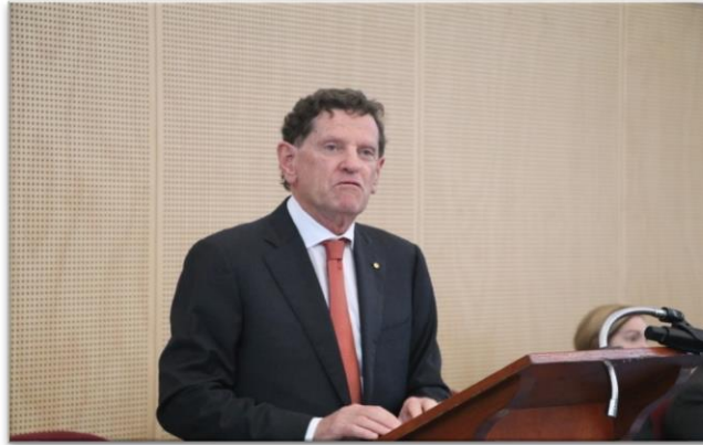
Former Chief Justice of Australia, Honorable Robert French, AC.

The first lecture was delivered by the former Chief Justice of Australia, Honorable Robert French, AC at the University of Papua New Guinea's New Lecture Theatre.