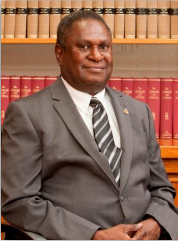
Chief Sir Gibuma Gibbs Salika, GCL, KBE, CSM, OBE Chief Justice of Papua New Guinea and Chairman of the Board

Sir Gibuma Gibbs Salika is the Chief Justice of the Supreme and National Courts of Papua New Guinea. He has a Bachelor of Law degree (LLB) from the University of Papua New Guinea. Sir Gibbs Salika commenced employment with the Office of the State Prosecutor as the State Prosecutor after being admitted to the bar in 1979. He later joined the PNG Ombudsman Commission as a Legal Counsel and then as a Magistrate. In 1990, he was appointed as a Judge of the Supreme and National Courts of Papua New Guinea and then as Deputy Chief Justice from February 2009 to November 2018.