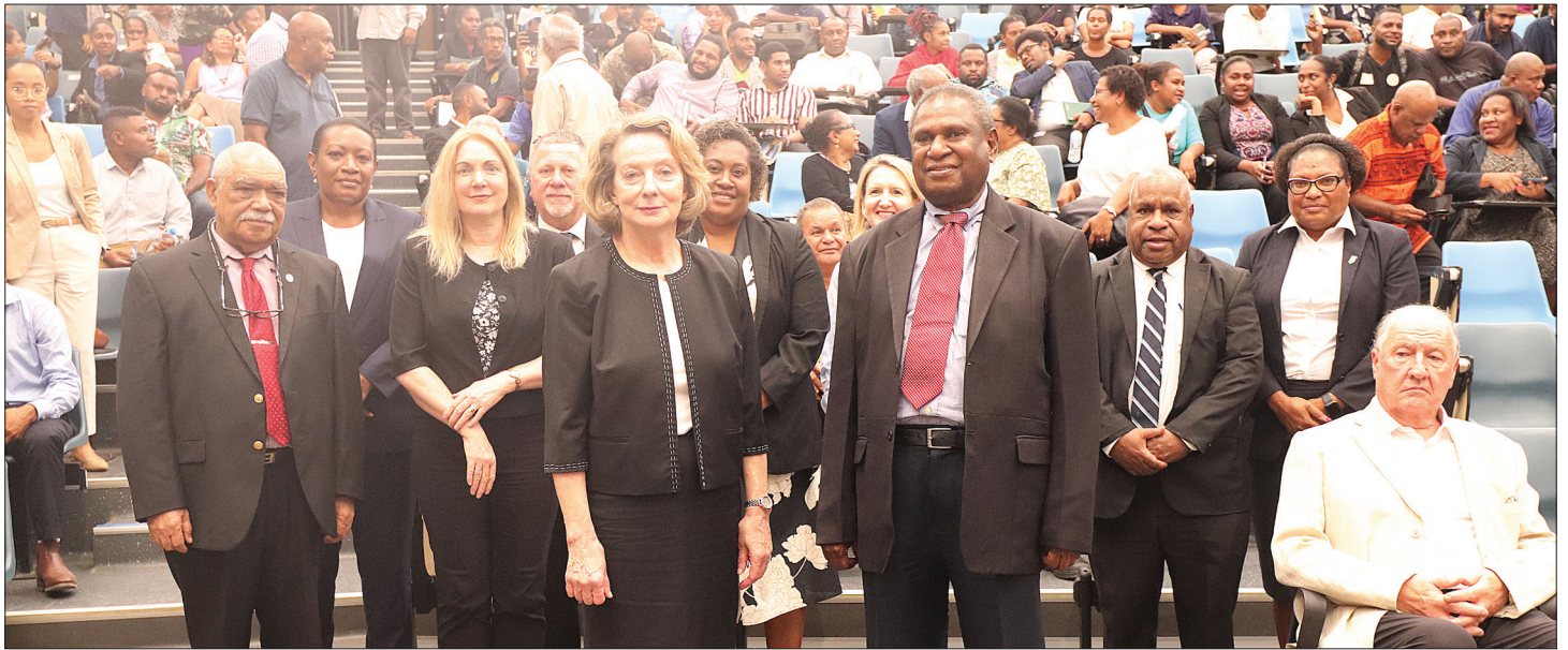
Australian Chief Justice Susan Kiefel (front left) and Chief Justice of PNG Supreme and National Courts Sir Gibuma Gibbs Salika along with other PNG Judges at the Sir Buri Kidu Lecture Series.

A USTRALIAN Chief Justice Honourable Susan Kiefel says judicial reviews are a critical part of the court process as these reflect the importance of the Constitution. She said this when giving a lecture at the Sir Buri Kidu Lecture Series on the topic of “Prerogative writs and modern judiciary review - constancy and change” at the University of Papua New Guinea on May