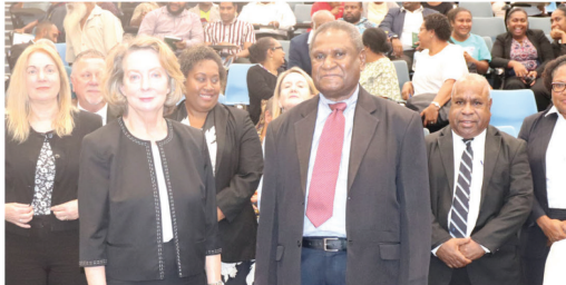
Australian Chief Justice Honourable Susan Kiefel AC LLM (left) with Chief Justice Sir Gibuma Gibbs Salika with Judges at the Sir Buri Kidu Lecture Series.

The Chief Justice of Australia Honourable Susan Kiefel AC LLM on her visit to PNG for the Sir Buri Kidu Lecture Series visited the New Court Complex, the PNG Centre for Judicial Excellence, the National Museum, the Parliament House and the Legal Training Institute. Below is a pictorial of her and the places that she visited.