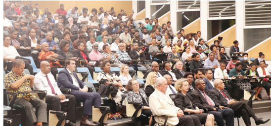
Students, Lawyers and Judges at the Sir Buri Kidu Lecture Series.