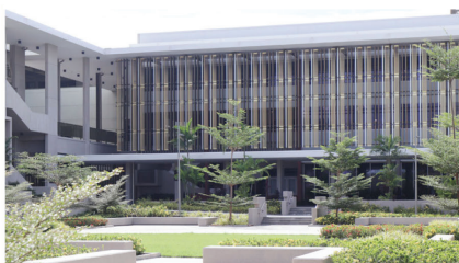
The new Court Complex.