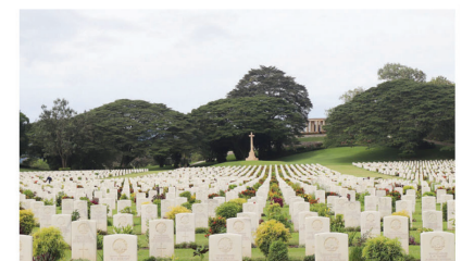
The Bomana War Cemetery.