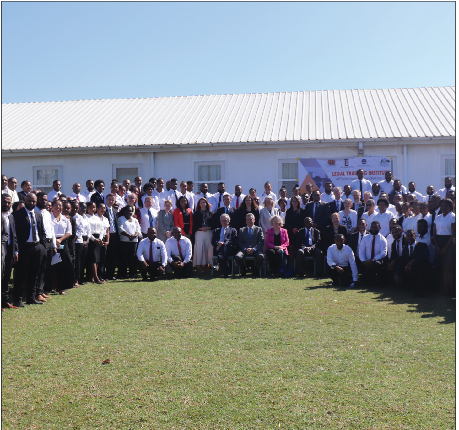
Queensland Chief Justice speaking to the LTI students during the 24th Civil and Criminal Advocacy workshop series.

D O not plan too far ahead and take opportunities with an open mind.