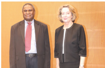
(Left-Right) Chief Justice Sir Gibbs Salika and Australian Chief Justice Honourable Susan Kiefel AC LLM.