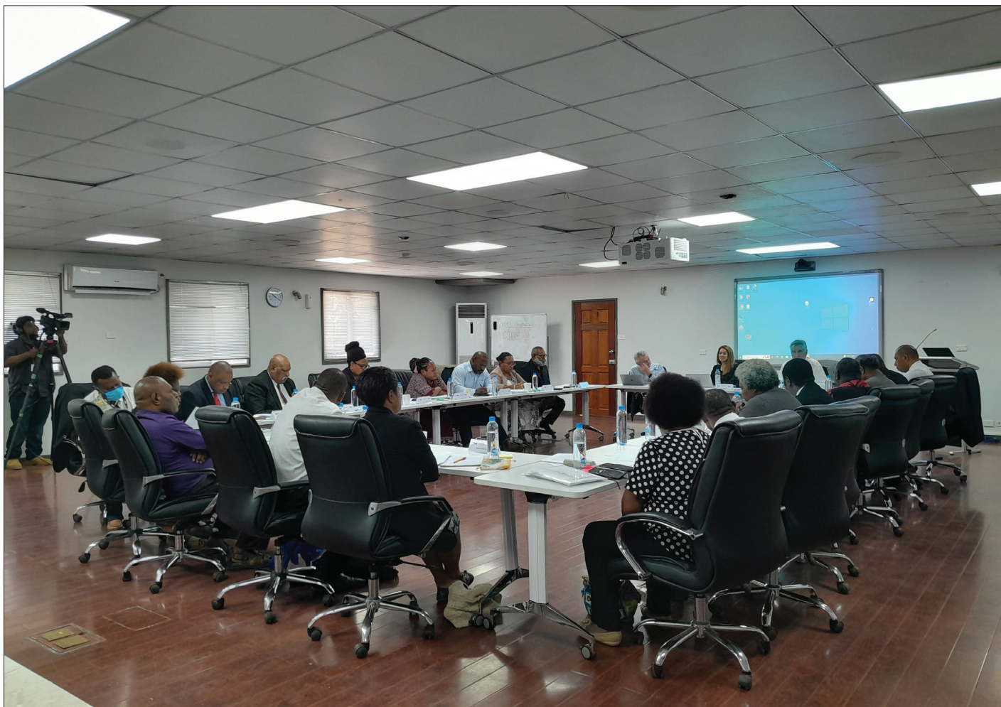
Magistrates all set during the one-week forum.

THE Chief Justice of Papua New Guinea Sir Gibuma Gibbs Salika has urged Judges and Magistrates of the Waigani Supreme and National Courts to attend judicial workshops as it was vital to equip them in their line of work.