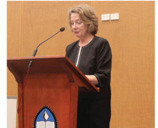
Susan Kiefel AC LLM at the Lecture Series.