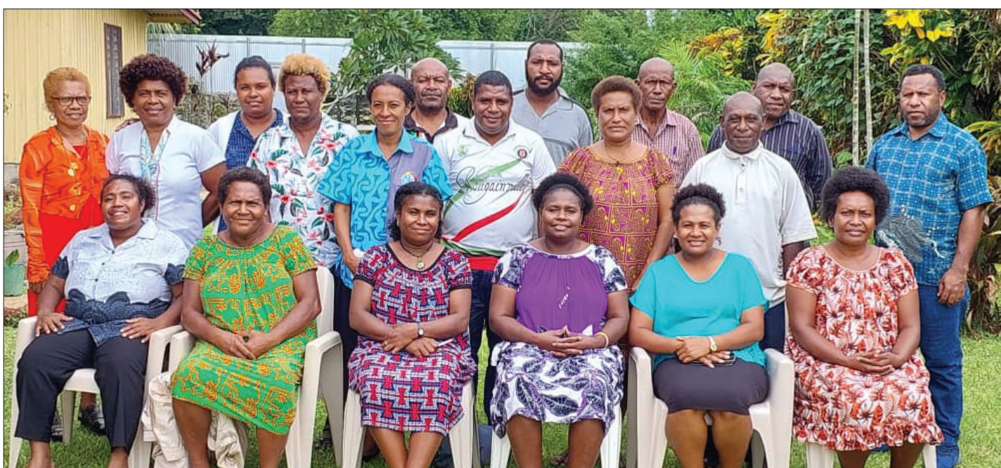
Participants of the recent customer service and computer skills training in Kavieng, New Ireland Province.