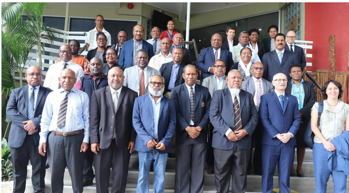
Judges and Magistrates at the Anti-Money Laundering and Counter Terrorism Finance Training.