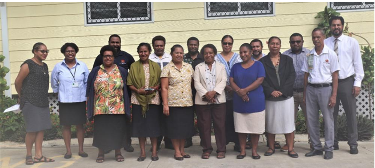
Magisterial Services Business Unit managers and training facilitators