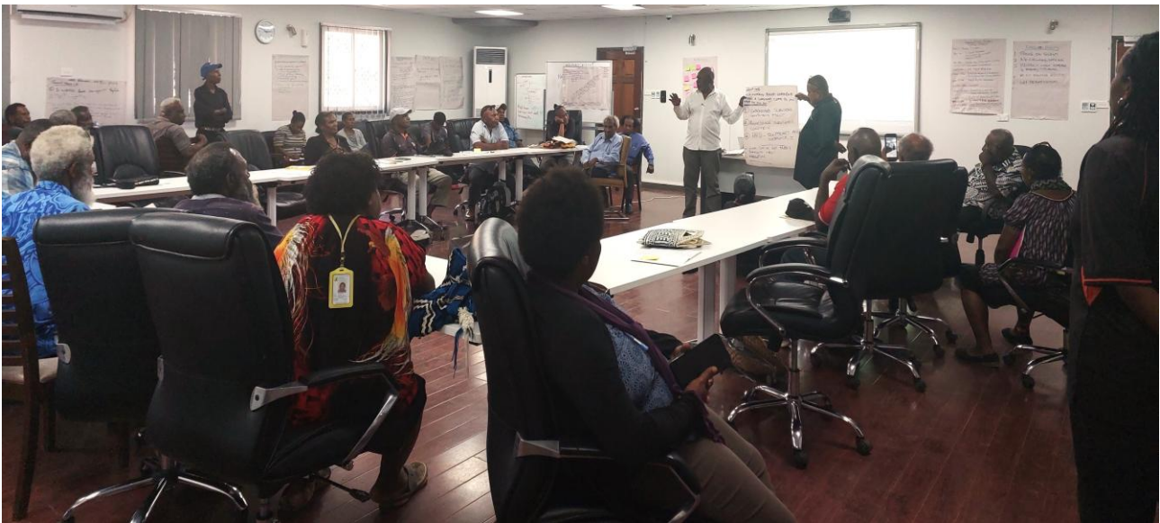
Participants of the Human Rights Defenders training

village court magistrates about laws relating to Human Rights, and to enable Village Court workers to act as Human Rights Defenders in their respective jurisdictions.