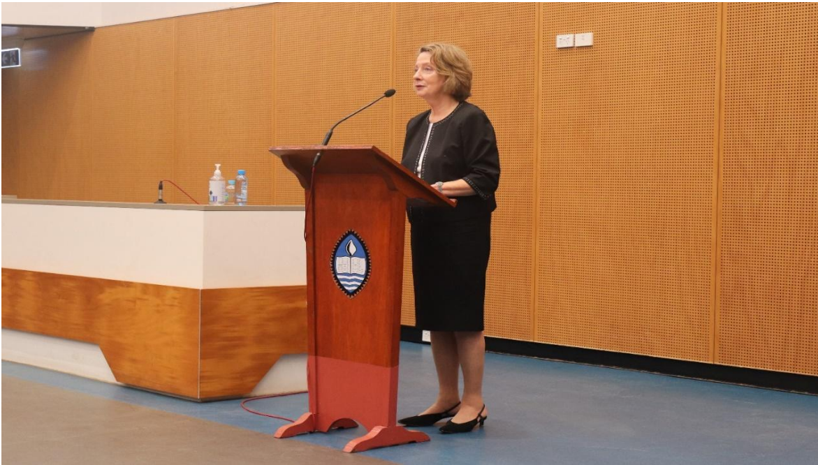
Lecture presentation by the former Chief Justice of Australia, Susan Kiefel, AC, KC.